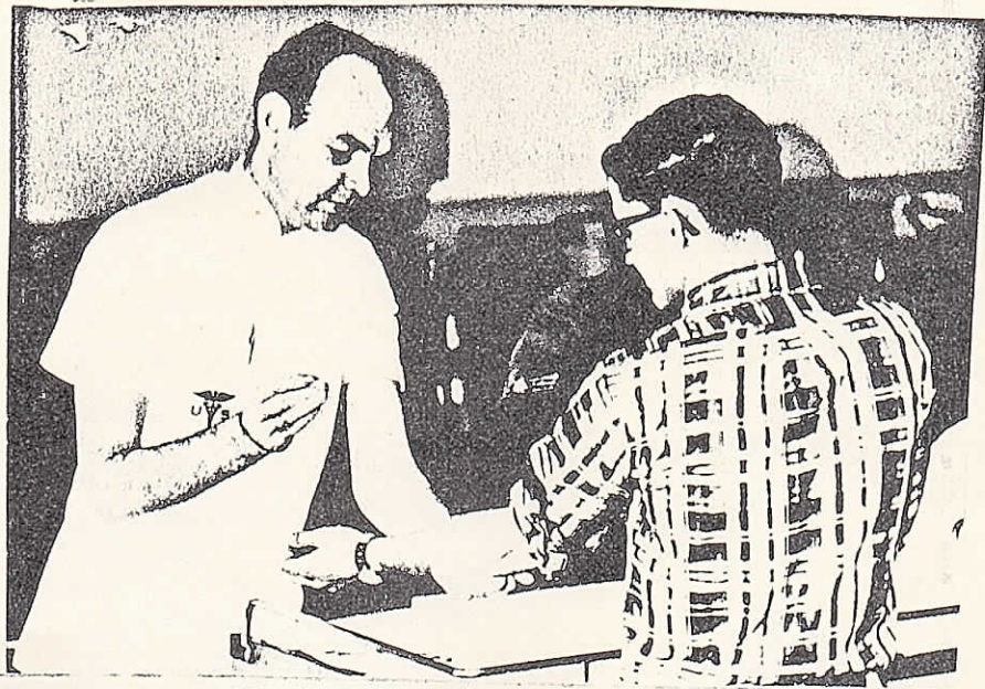
BE BRAVE? (are you kidding?)

Remember that fateful day when the entire population was marched into the dry lunch room to be branded for life?